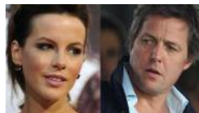
» Top 10 sexiest accents around the world